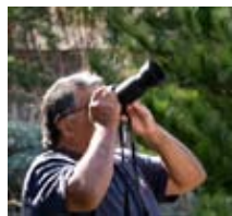
PG Butterfly Sanctuary