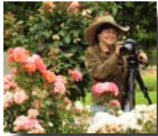
Villa Mira Monte