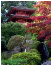
SF Japanese Tea Garden (Toby Weiss)