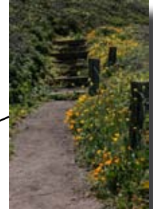
Garrapata State Park