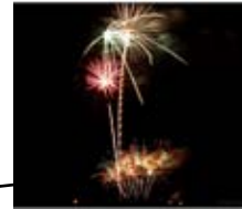
Fireworks