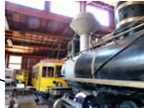
SJ History Museum (Roy Hovey)