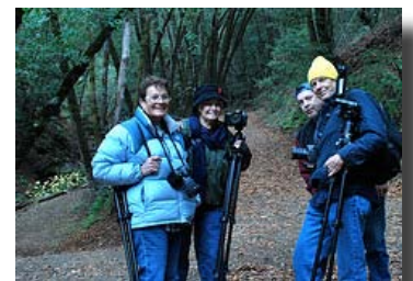
Uvas Canyon Co Prk (Roy Hovey)