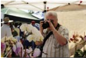
World Wide Photo Walk