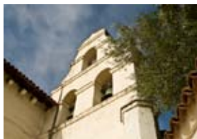
San Juan Bautista