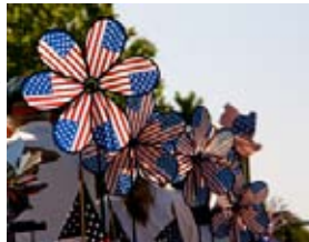
Parade (Jackie Wall)