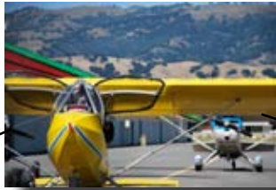
Wings of History